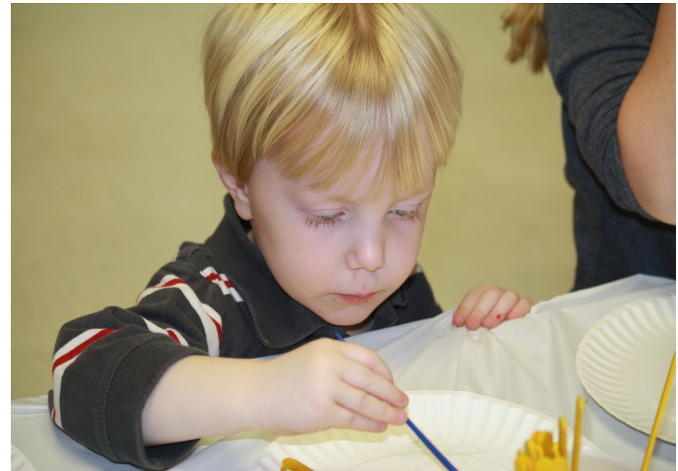
The Sunday School children enjoyed Epiphany Sunday.