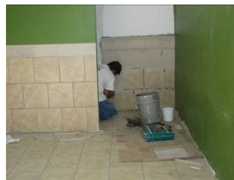
Installing the Drop Ceiling (Left) and Tiling the Bathrooms (Right)

The VCT floor (Vinyl Composition Tile) in the new preschool wing is now installed in addition to the ceramic tile in all of the 4 big bathrooms and new Wesley kitchen. The drop ceiling looks nice in the preschool hallway. Very soon excavation for the walkway bridge between the new building and Central Drive will begin.